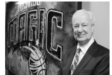
Featured speaker: Pat Williams NBA Sports Executive

Man Up! is a ministry of Clarks Summit University